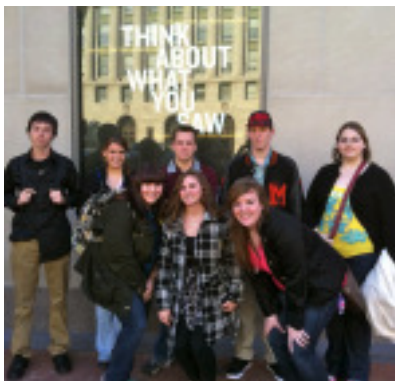
International Affairs Seminar, 2011

This month we kick off the 2012 Annual Fund campaign for the Oklahoma Regional Church. Begun 10 years ago, the Annual Fund has become a vital funding stream for ministries accomplished throughout Oklahoma. Last year, more than