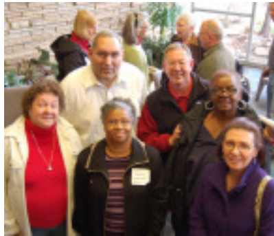
Leadership Training School, 2012

Church Pastoral Staff offered two different occasions for Oklahoma pastors to gather together for worship. Designed to provide pastors the opportunity to "sit in the pew" for a change, the spiritual life of our clergy is always something that we strive to encourage. Prayer retreats